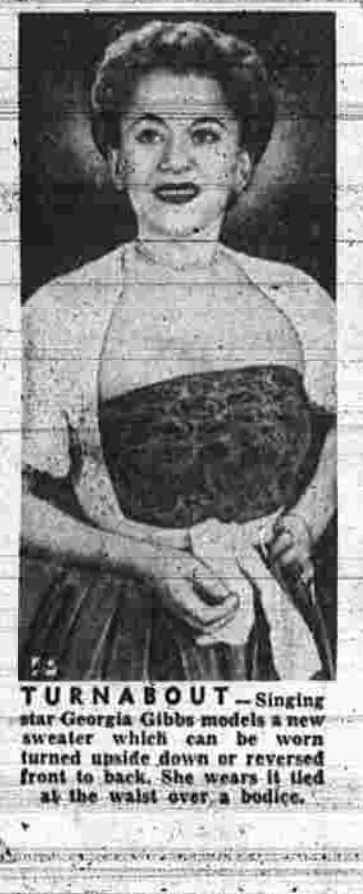
TURNABOUT —Singer star Georgia Gibbs models new sweater which can be worn turned inside down or reversed front to back. She wears it tied at the waist over a bodice.