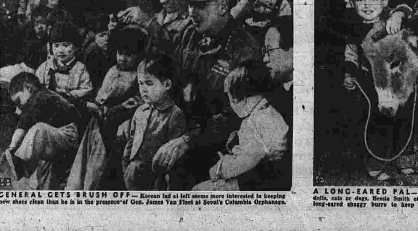
GENERAL GETS BRUSH OFF —Korean lad at left seems more interested in keeping new shoes clean than he is in the presence of Gen. James Van Fleet at Seoul's Columbia Orphanage.