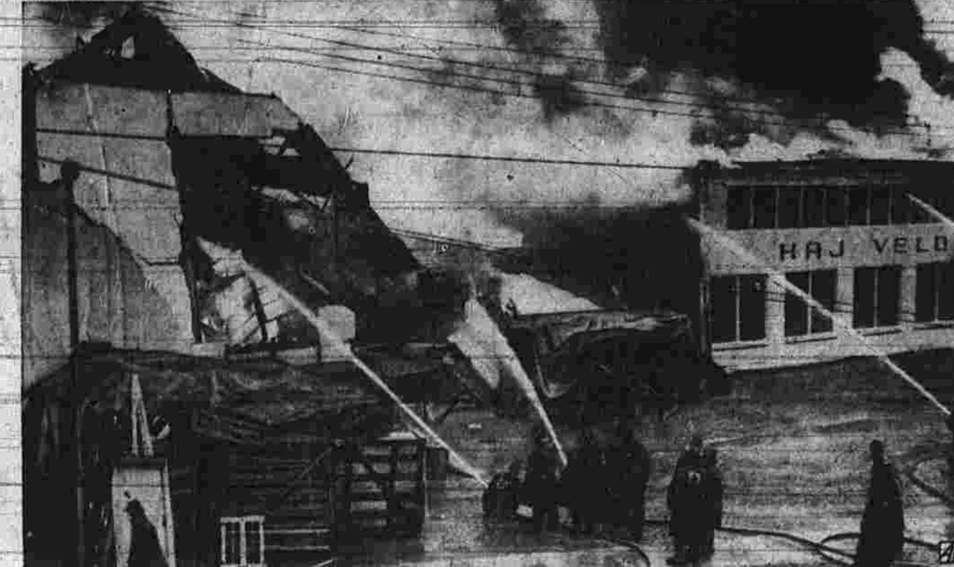
FINIS TO CINEMATIC LANDMARK —Fire sweeps old Parson Studio at Fort Lee, N. J., lately used to build scenery. Studio was birthplace of some of the early movies in which Mary Pickford and director D. W. Griffith climbed to fame.