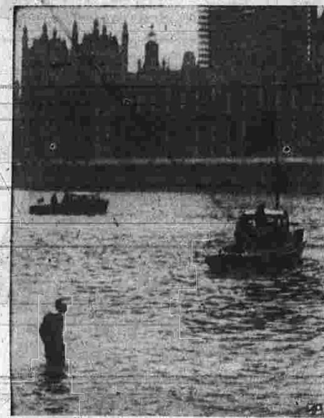
WATERY RESEARCH —Lord Noel-Buxton studies into Thames River during attempt to ford stream at Westminster. His venture was part of research for book on London topography.