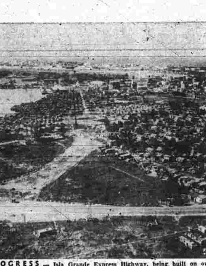
ROAD MARKS PROGRESS —Jala Grande Express Highway, being built on outskirts of San Juan, P. R., cuts through heart of slum area which will be cleared away by end of 1952.